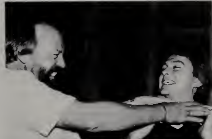
BUTLER GETS GRIP ON CASSIDY — Larry Butler (l) was recently in recording at Sound Emporium Studios in Nashville, where he produced former teen heartthrob David Cassidy in his first recording session in some six years. It was Cassidy's first venture ever into a Nashville recording studio.

adapter which pipes the network's signal through his home stereo unit, a process similar to that used by MTV. Group W Satellite Communications, the firm handling the network's sales, marketing and distribution, expects to close 1983 with more than 10 million subscribers.